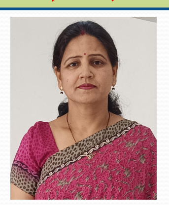
Head of the Department